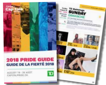
2018 Pride Guide

The 2019 Pride Guide provides your organization with direct market access to the Ottawa– Gatineau 2SLGBTQ+ communities and is the official publication of the region’s Pride Festival, taking place from August 18-25, 2019 . Advertising space is limited so book today!